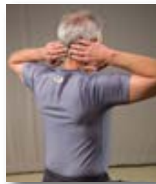
SHOULDER BLADE SQUEEZE

Standing: Think of growing taller, lift your breastbone.