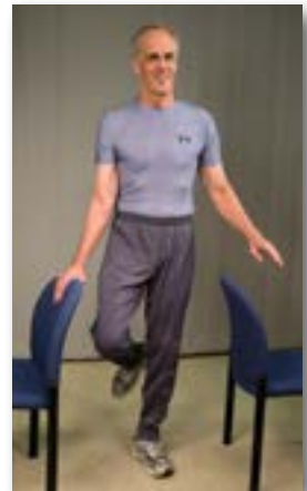
SINGLE HAND SUPPORT